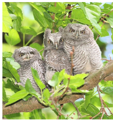
Owls at Ojibway