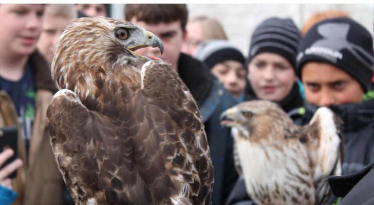
Students participate in a hawk release at Ojibway

Open seven days a week, there is no charge to visit the newly reconstructed Ojibway Park Nature Centre.